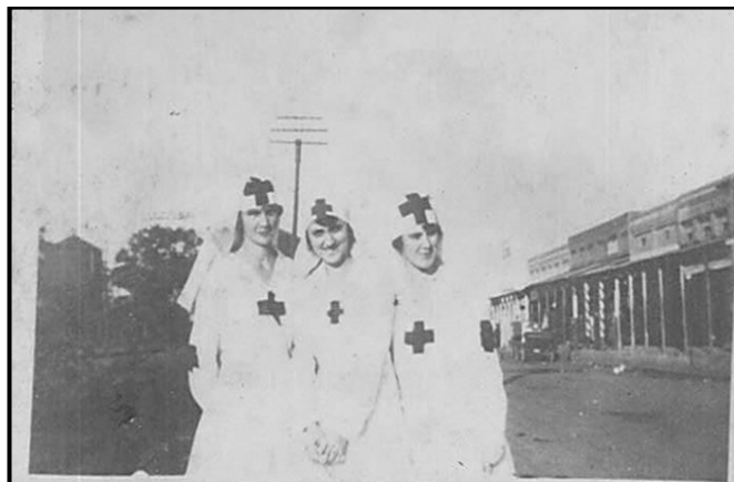
Armistice Day in Gurdon, 1918